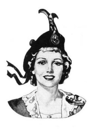
THE MACDONALD LASSIE