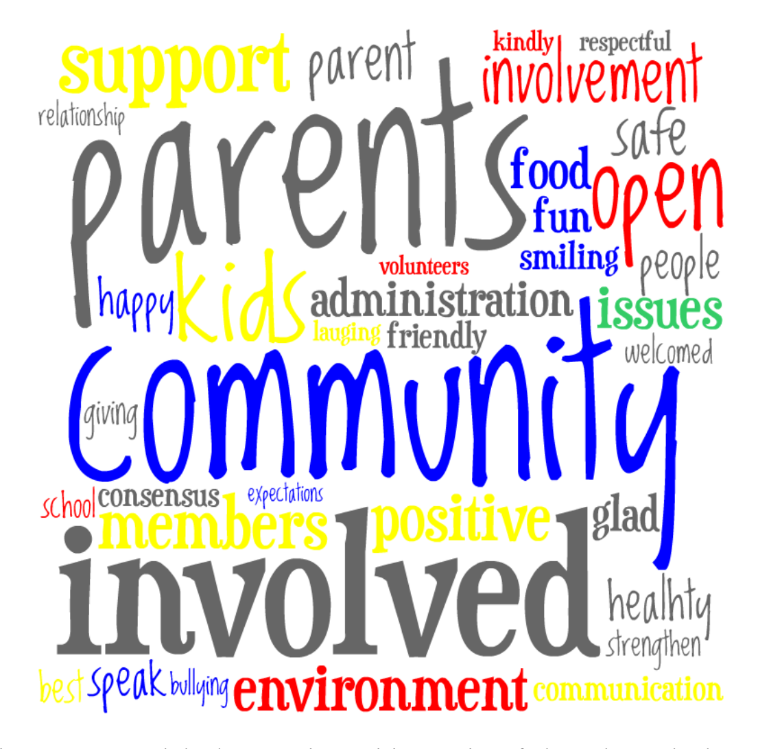
Figure 3. Word cloud representing participants' view of what makes a school healthy.

words – those occurring most frequently in the text of the participants' answers - are larger in size. One participant stated, "there's a sense of community, sense of everyone sort of working for the greater good of the school." (Participant 2)