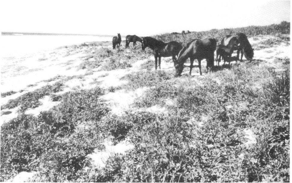
Fig 3. A gang of 11 wild horses grazing on Beach Pea ( Lathyrus maritimus ) and Marram ( Ammophila breviligulata ) near Main Station.