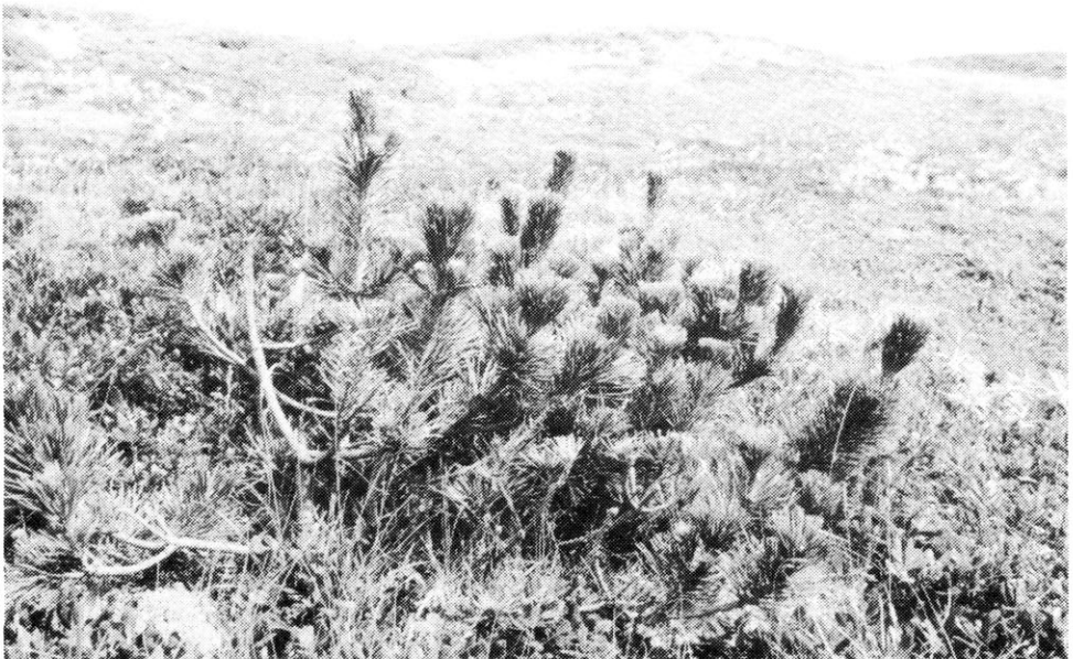
Fig 4. A decumbent Scots Pine ( Pinus sylvestris ). This one is a recent planting and not a survivor of the great afforestation attempt of 1901.