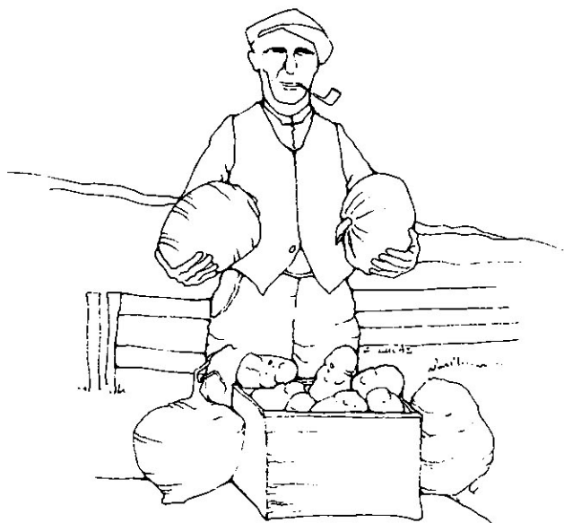
Fig 5. Turnips, potatoes and squash grown at Main Station, Sable Island in 1921.

The effect of the feral horses is not yet clear. However, it seems likely that excessive grazing in certain areas has increased erosion, and this would be especially important during years of peak population. Of course the horses recycle nutrients and minor disturbance probably creates habitat for certain species. Thus, the erosion damage may be fully or partly compensated for. The horse population has varied from 200 to 300 in a cyclic pattern over the past 20 years and is apparently under natural control (Lock 1971). Ongoing studies, including enclosure plots are attempting to clarify the relationship between horses, vegetation, and erosion.